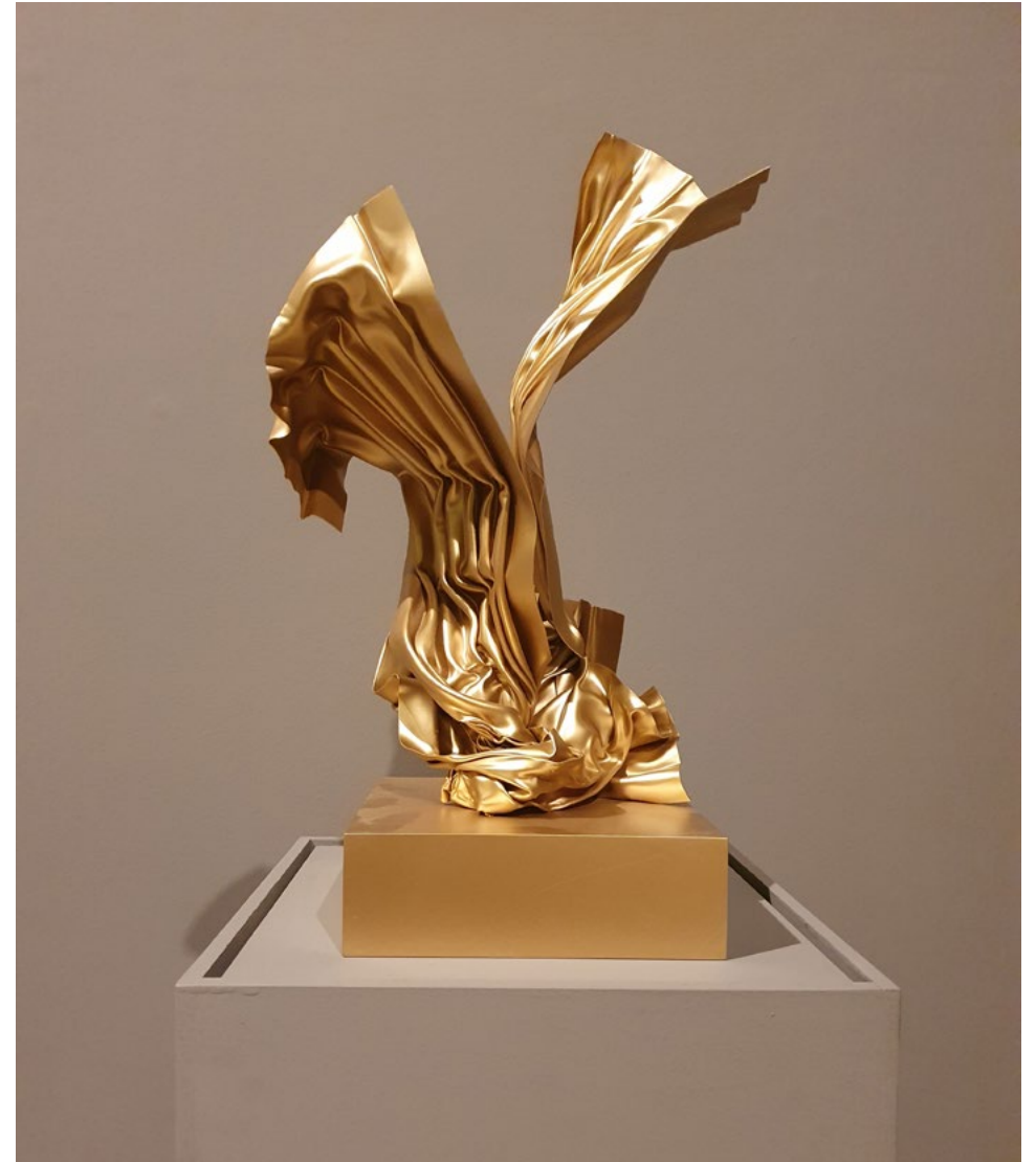
12. Thésée PetG, enamel paint 35x60x30cm 2,000 .BD