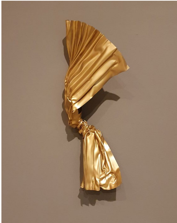
8. Cadmus et Hermione PetG, enamel paint 35x95x20cm 1,700 .BD