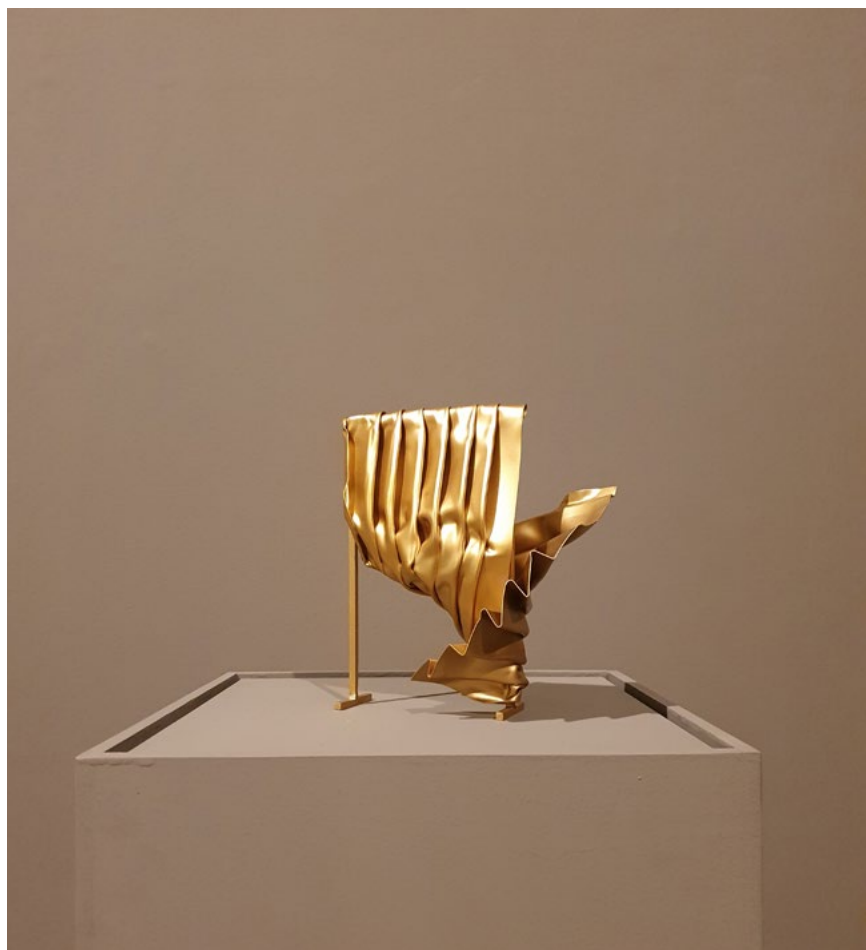
17. Isis, 2023 PetG, enamel paint 25x30x15 cm 600 .BD