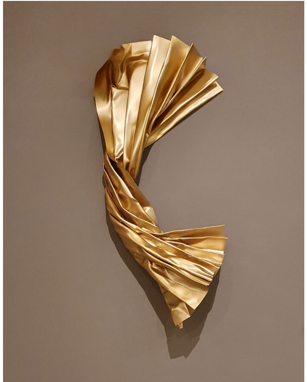
7. Achille et Polyxène PetG, enamel paint 70x150x30cm 2,600 .DB