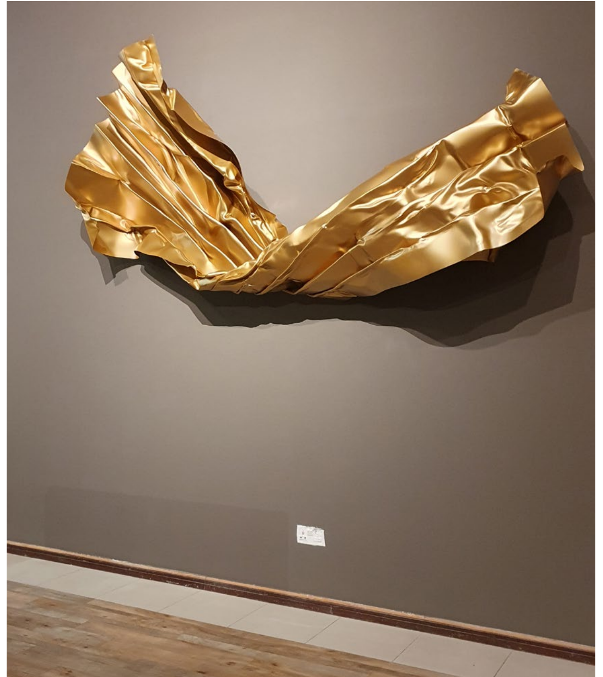
1. Amadis 2023 PetG, enamel paint 250x120x50cm 7,000 .BD