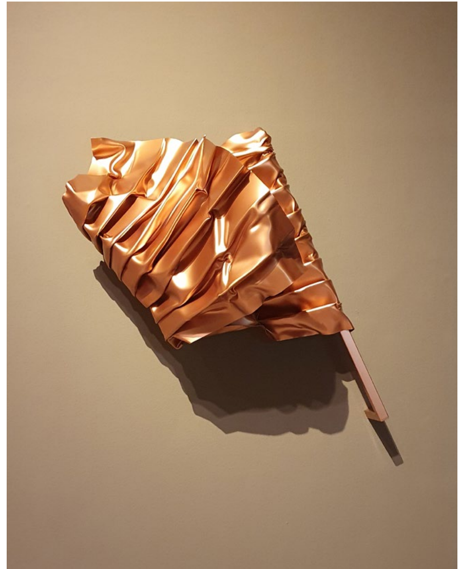
9. Roland PetG, enamel paint 105x100x45 cm 3,200 .BD