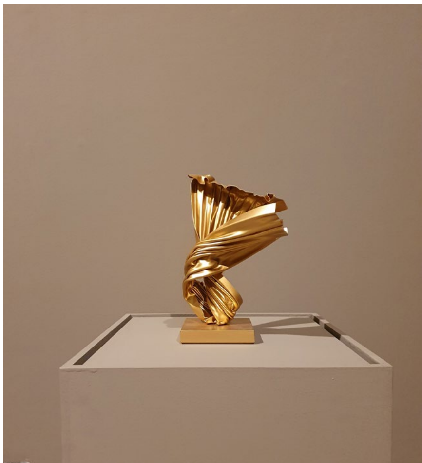
15. March Pour La Cérémonie Des Turcs, 2023 PetG, enamel paint 20x30x20 600 .BD