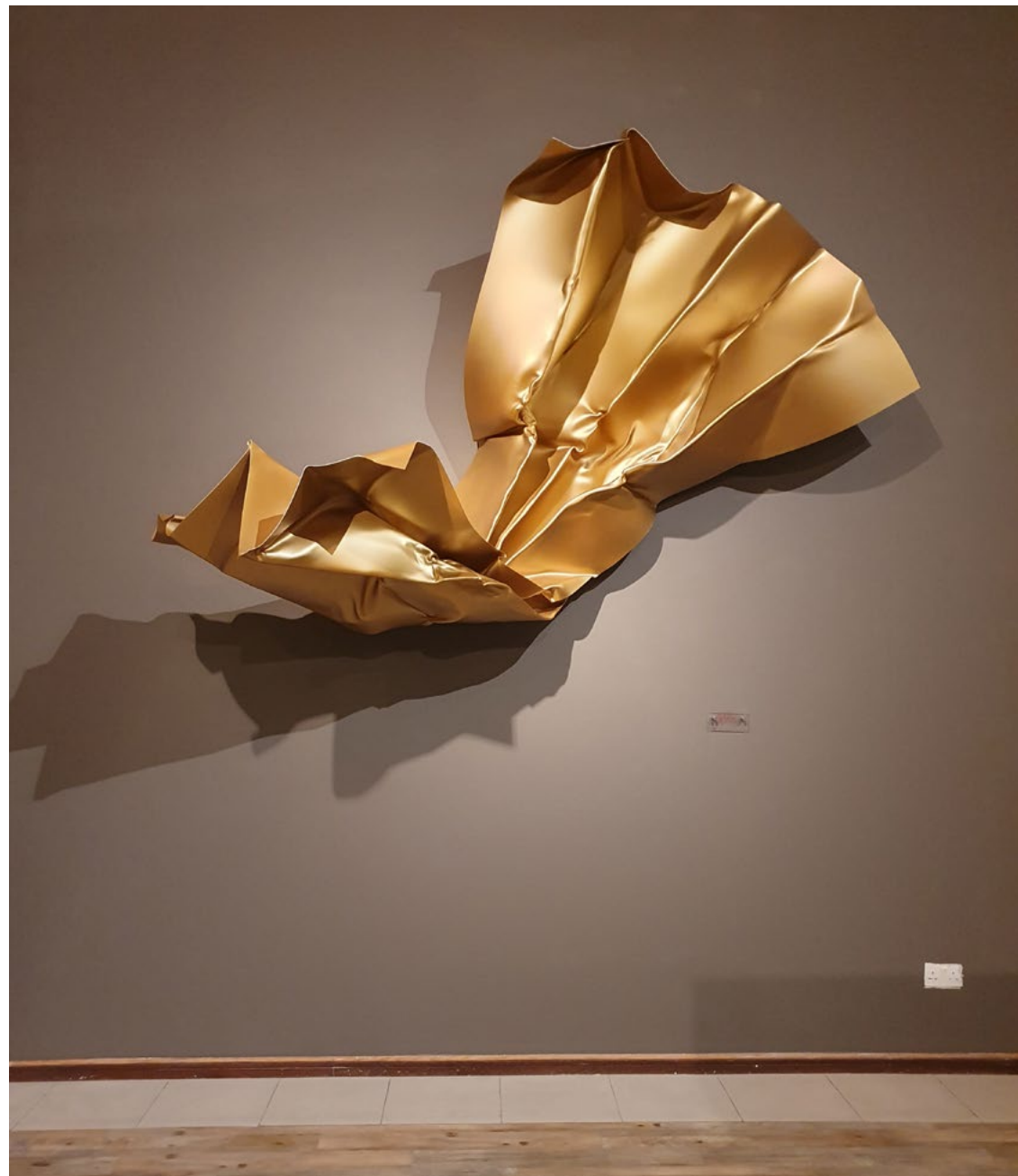
6. Persée 2023 PetG, enamel paint 275x185x90cm 7,000 .BD