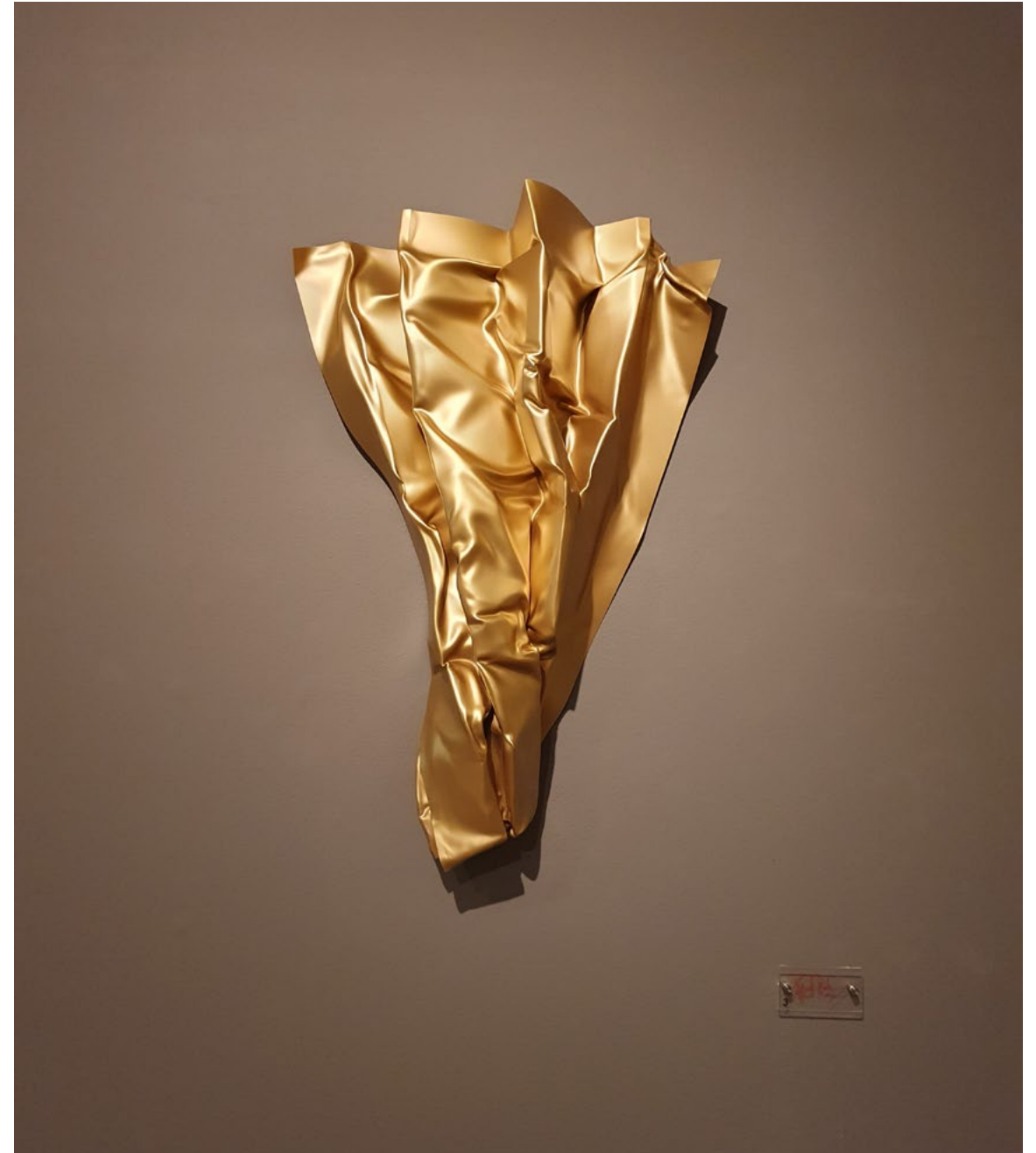
3. Phaëton 2023 PetG, enamel paint 70x115x20cm 2,600 .BD