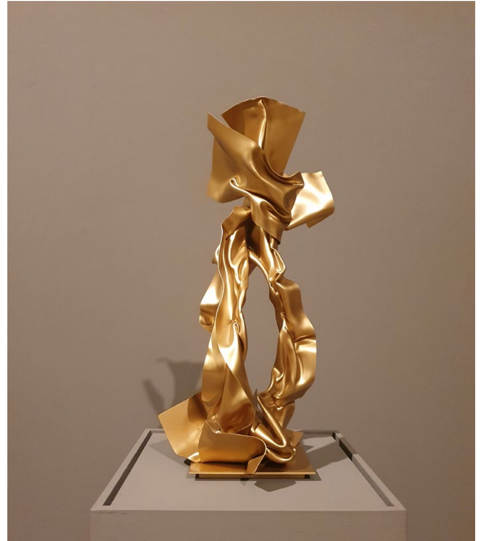
11. Le Bougeois gentilhomme 2023 PetG, enamel paint 30x65x30cm 2,000 .BD