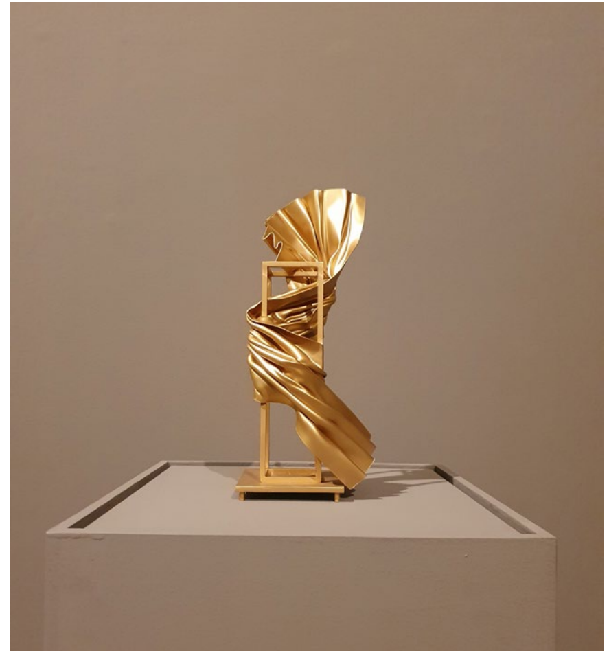
14. Atys , 2023 PetG, enamel paint 15x35x15 cm 700 .BD