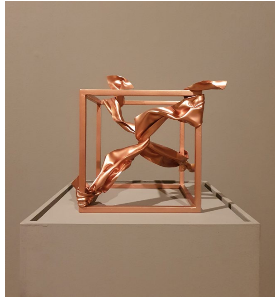
13. Ballet Royal de Flore 2023 PetG, enamel paint 30x30x32cm 1,700 .BD