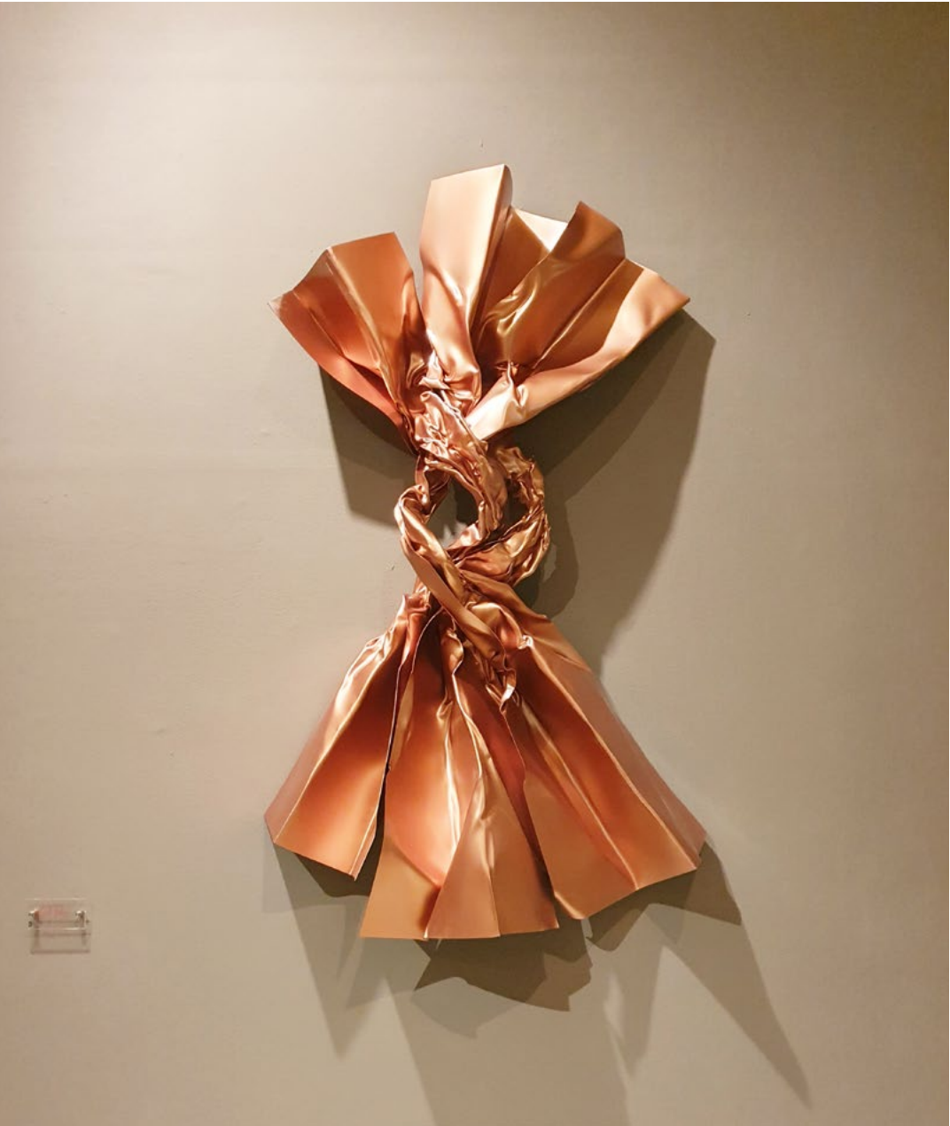
5. Armide PetG, enamel paint 105x175x30cm 3,500 .BD