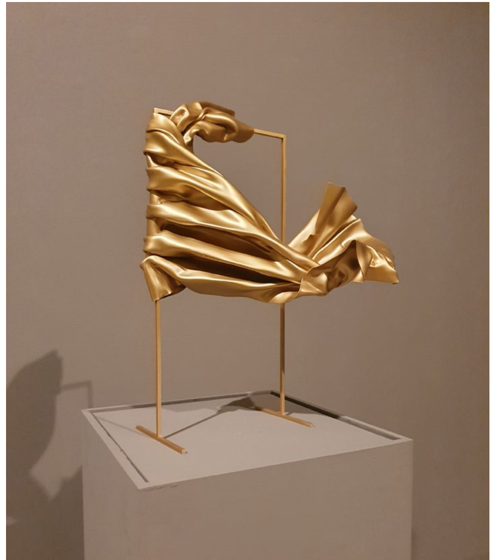
20 Dominus XXIV, 2023 PetG, enamel paint 35x55x35 cm 2,000 .BD