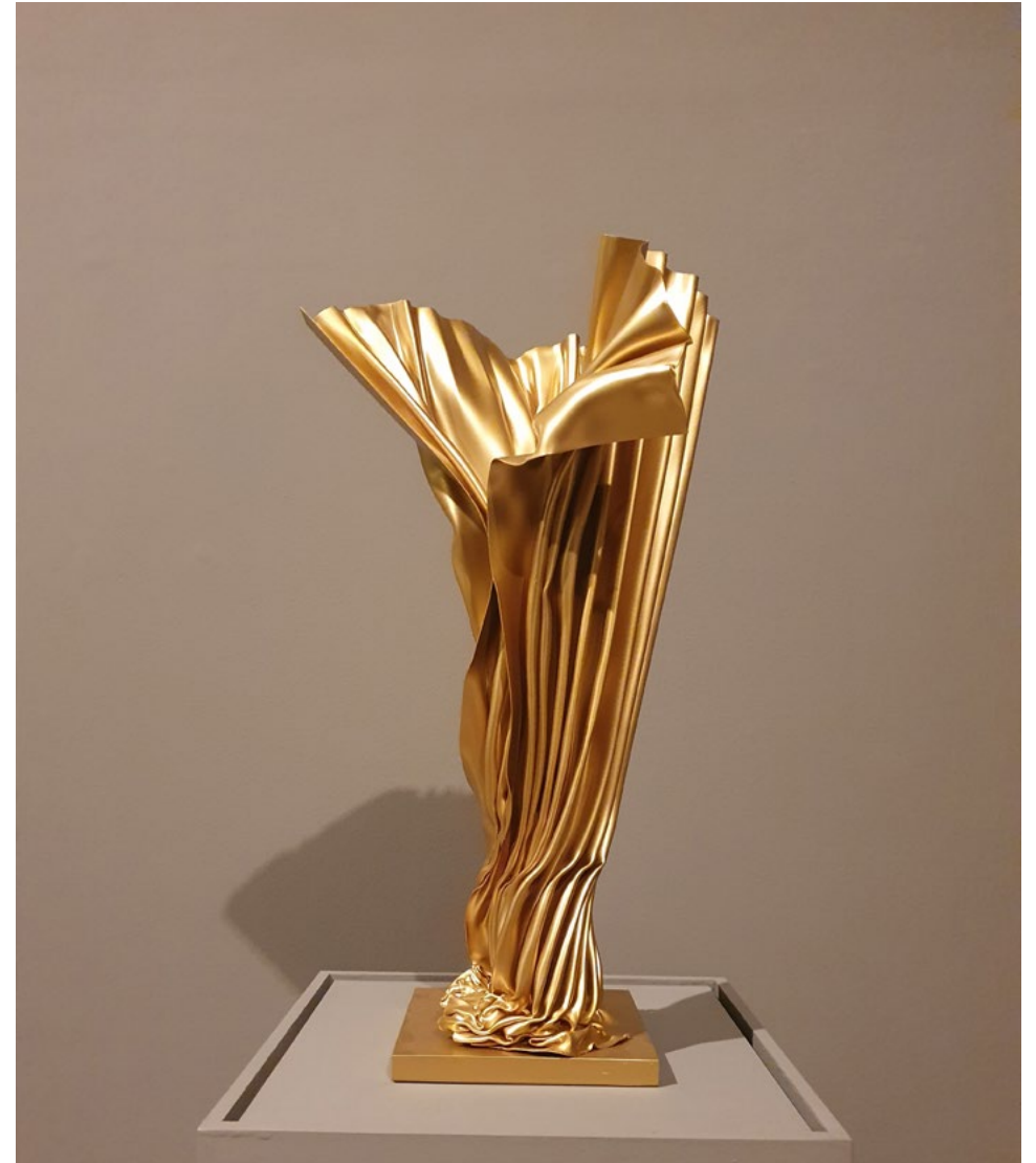
22. Récit de la beauté, 2023 PetG, enamel paint 35x62x30 cm 2,700 . BD