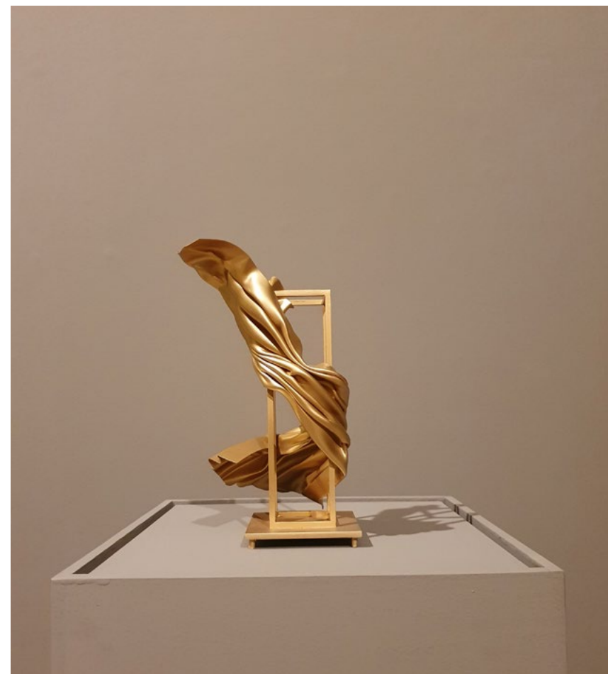
18. Psyché 2023 PetG, enamel paint 25x30x20 cm 700.BD