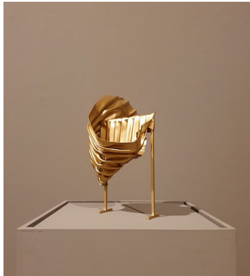
26. Suite de Pièces, 2023 PetG, enamel paint 30x35x25 cm 600 .BD