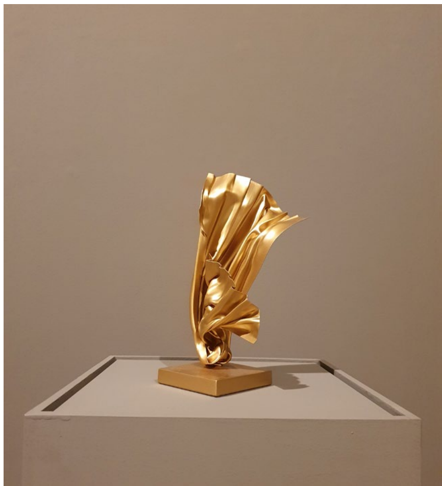
23. Le triomphe de l'amour, 2023 PetG, enamel paint 25x30x25 cm 600 .BD