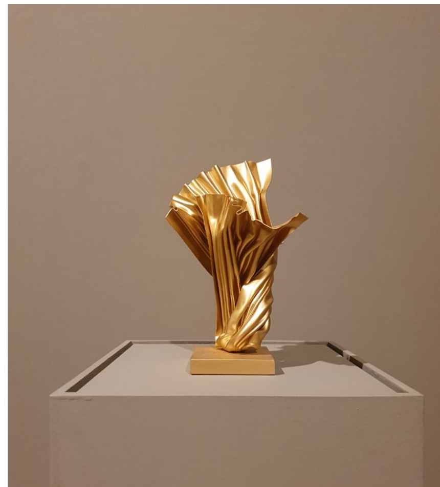
16. Folia , 2023 PetG, enamel paint 20x30x20cm 700 . BD