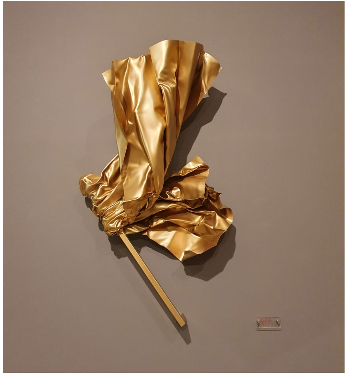
2. Alceste 2023 PetG, enamel paint 90x160x35cm 3,200 .DB