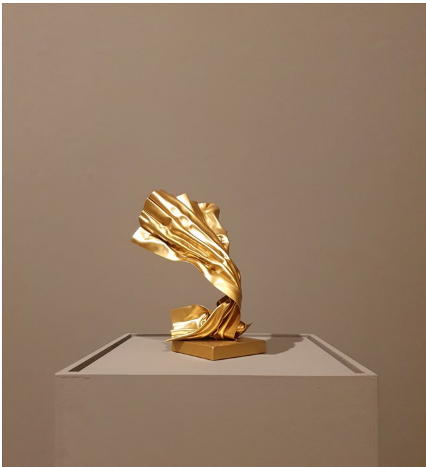
25. Le Bourgeois gentilhomme, 2023 PetG, enamel paint 25x30x20 cm 600 .BD