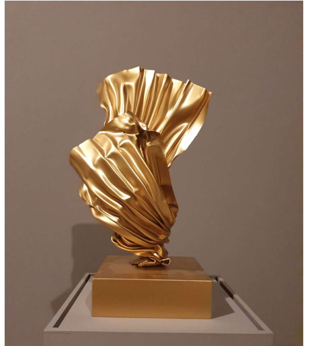
21 Ercole amante, 2023 PetG, enamel paint 35x60x25 cm 2,000 .BD