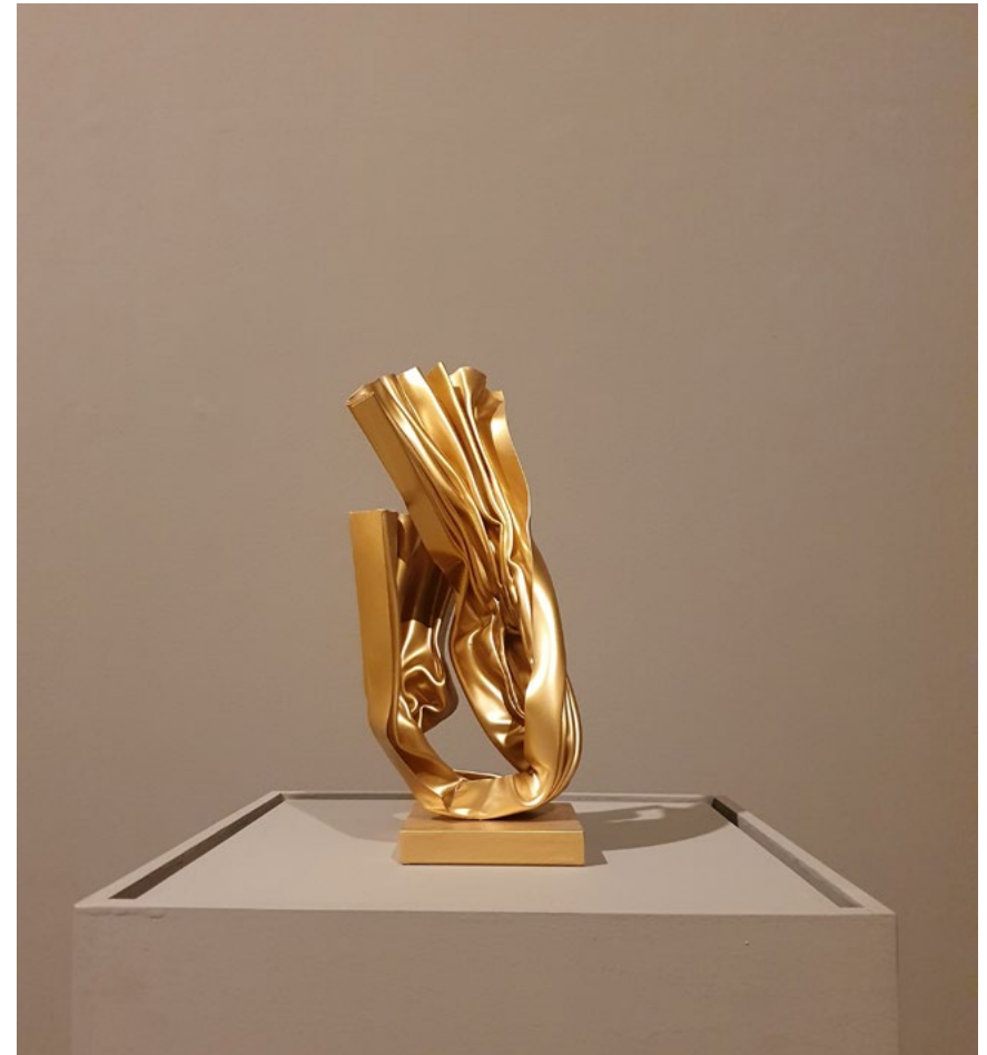
19. Marche du régiment de Turenne, 2023 PetG, enamel paint cm 20x35x20 700 . BD